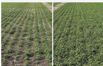
Raxil ® PRO